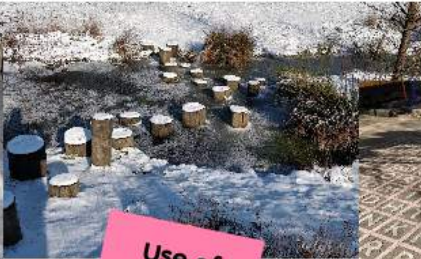
Use of Natural and Urban elements